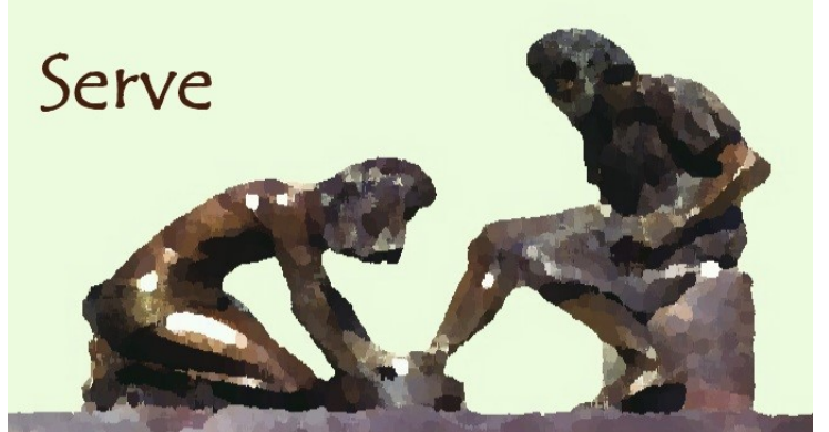
Click the image to learn more on how to get involved in the community