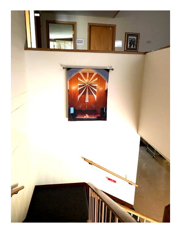
The banner is located along the steps from the first floor entrance hallway going up to the sanctuary.